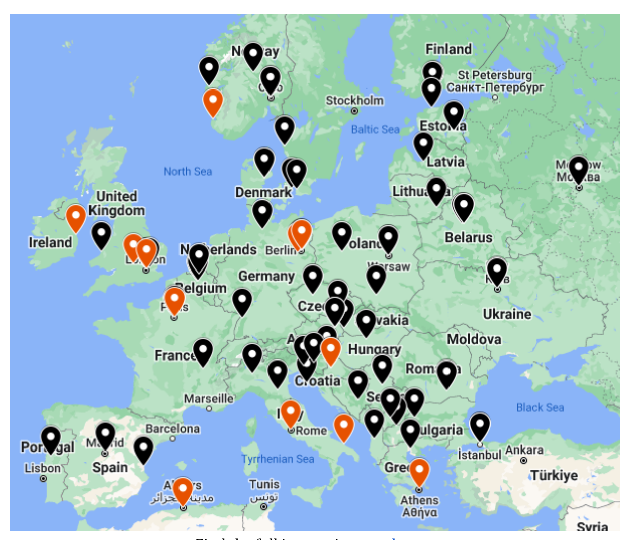
Find the full interactive map here.