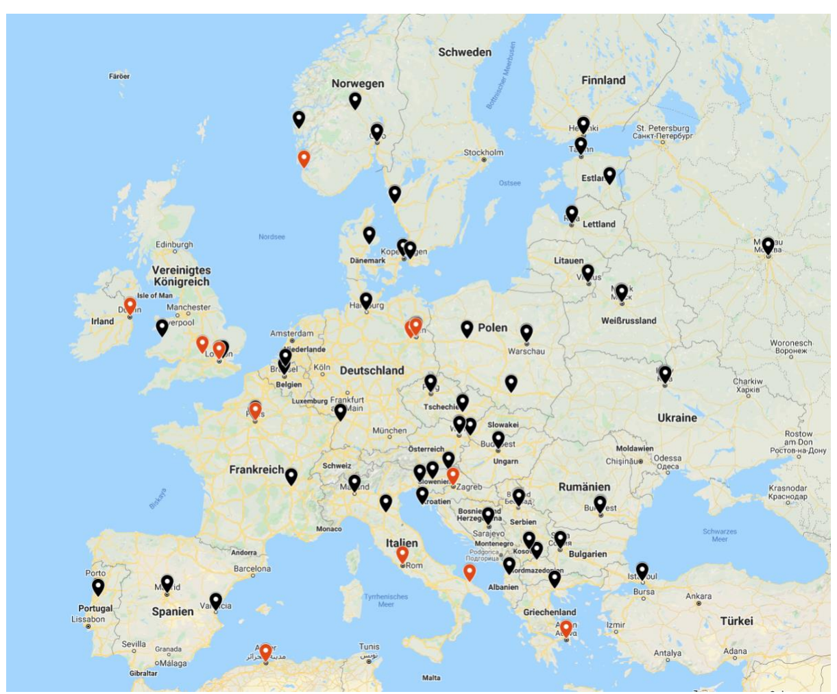
Find the full interactive map here.

Arbeitskreis Kulturwissenschaftliche Zeitschriftenforschung, Booksa, Dublin Review of Books, Einstein Forum, Fondazione Di Vagno, Free Speech Debate, Historein, ICORN, Internazionale, Kulturpunkt.hr, NAQD, Public Seminar, Tekstallmenningen, openDemocracy, VoxEurop