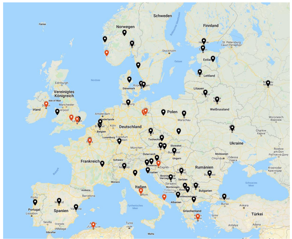
Find the full interactive map here.

Arbeitskreis Kulturwissenschaftliche Zeitschriftenforschung, Booksa, Dublin Review of Books, Einstein Forum, Fondazione Di Vagno, Free Speech Debate, Historein, ICORN, Internazionale, Kulturpunkt.hr, NAQD, Public Seminar, openDemocracy, VoxEurop