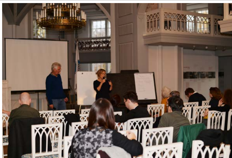
Barcamp, Tartu, October 2017

The opportunity for exchange between editors from different countries across Europe has been one of the key benefits of the European Meeting of Cultural Journals, since the first meeting in 1983. At the Meeting in Tartu, in addition to informal exchange during the conference, this was achieved by two workshops on Cross Media Publishing and Social Media, a participative “bar camp” format, where the conference participants set the agenda by suggesting topics to be discussed in working groups, as well as the internal network session during which Eurozine's activities were presented and discussed.