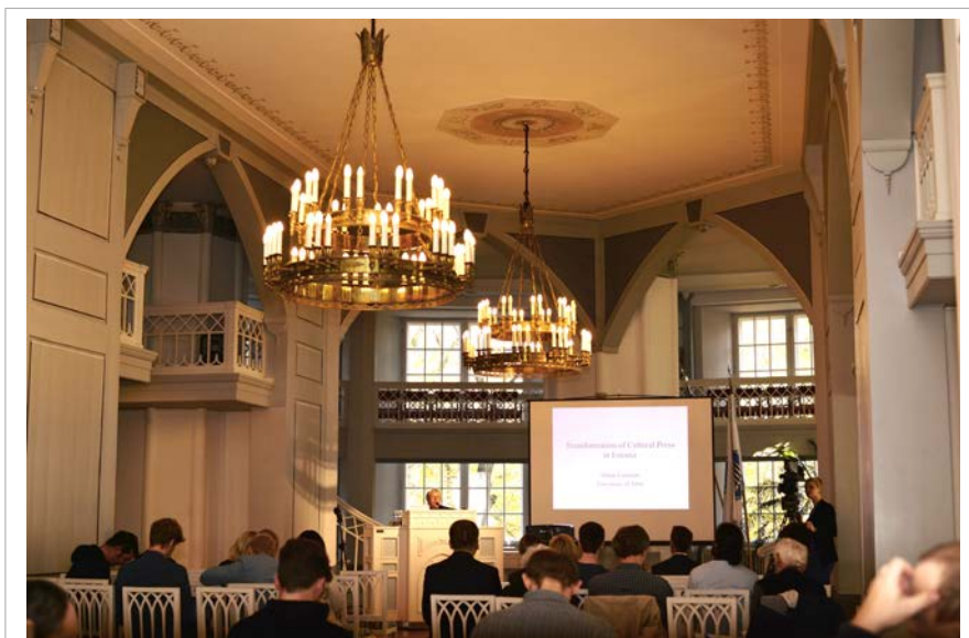
Presentation by Marju Lauristin, Tartu, October 2017

⇒ Download the full conference programme (PDF): http://www.eurozine.com/wp-content/uploads/2017/10/European-Meeting-of-Cultural-Journals-2017_Tartu_programme-2.pdf