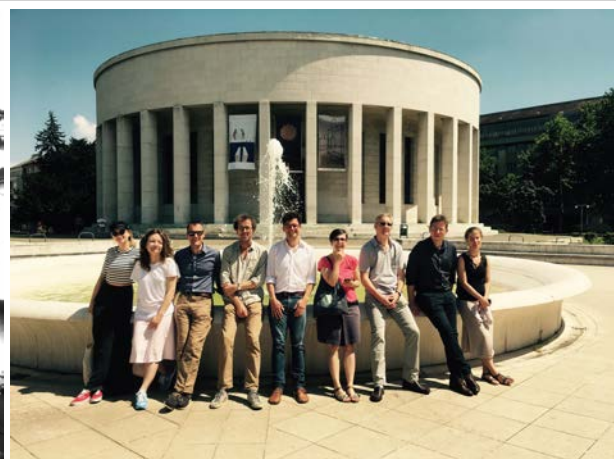
Editorial Board meeting in Zagreb, June 2017