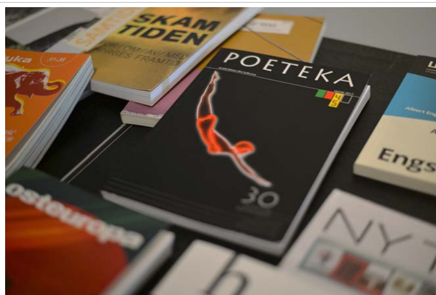
Partner Journals presented their current issues at the conference in Tartu

Eurozine's Board of trustees meets for the annual General Assembly as well as additional meetings throughout the year. The General Assembly was held on 11 May 2017 in Vienna.