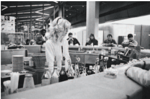
Victor Burgin, from Zoo78 (1978-79)

I would emphasize that I am talking about documentary in the art world . As I write, the Iranian filmmaker Jafar Panahi is in prison — primarily, it seems, because he was making a documentary about the mass protests that followed last year's dubious elections in Iran. The political value of documentary is conjunctural, context is as important as content. The political value of art primarily bears on neither content nor context but upon language . I see no point to "art" that calls upon the same general knowledge and interpretative capabilities I deploy when I read a newspaper.