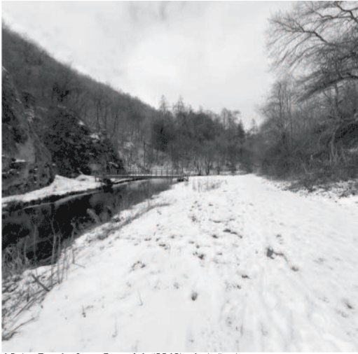
Victor Burgin, from Dovedale (2010), photo/text

For example, one of my constant technical concerns is with the elaboration of forms of language adapted to the situation of reading or listening in the gallery. In general I aim for texts that condense relatively large amounts of information into small spaces, and which allow readers to bring their own associations to fill out the meanings of the