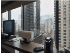
Victor Burgin, from Hôtel D (2009)

I think by analogy of an old movie version of H. G. Wells' The Invisible Man where a number of devices are used to signify the invisible man's form — for example, in one scene, some trash whirls into the air on a windy street and sticks to him; in another scene, disembodied footprints advance across a snow–covered field. We would not say that either the trash or the tracks are the invisible man, but they are the more or less contingent conditions of his "appearance" in the visible world. Hôtel D , in common with all of my works in recent years, is an attempt to represent some unrepresentable "thing" — in this case deriving from my being there , in the Hôtel–Dieu in Toulouse, and being aware of the